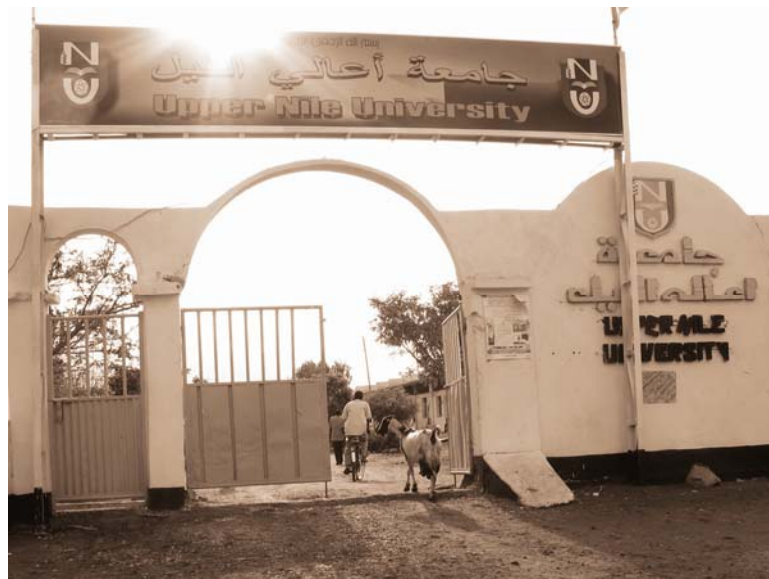
Entrance of Upper Nile University, Malakal.

Importantly, the translation of post-conflict development knowledge and practice from across Sudan can prove beneficial for the development of Southern Sudan. While it is understandable that direct collaboration with organizations based in the north may be viewed as politically undesirable, organizations which have successfully demonstrated social and economic empowerment of local communities can be looked to by policy makers and implementing agencies for their expertise. The development and educational sectors, which have traditionally crossed between Khartoum and Southern Sudan at various times of war and peace, may provide a readily available platform for the sharing of knowledge and experience. University examples include the return of expertise, staff and resources to the Upper Nile University, Juba University and other southern universities from Khartoum. The work of Ahfad University for Women in successfully training large numbers of teachers for early childhood and primary education across ethnic, cultural, religious and political divides can assist Southern universities in addressing the critical need for quality primary school teachers, especially in rural villages. From the development sector, Practical Action's practice of creating and supporting women and community development associations, as well as the dissemination of culturally and market-appropriate technology interventions, can provide extremely useful for communities in Southern Sudan.