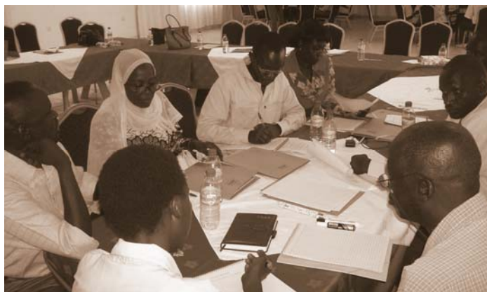
One-day workshop: Group discussion, Juba. March 2009.