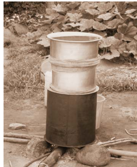
Brewing of local alcohol, Juba.