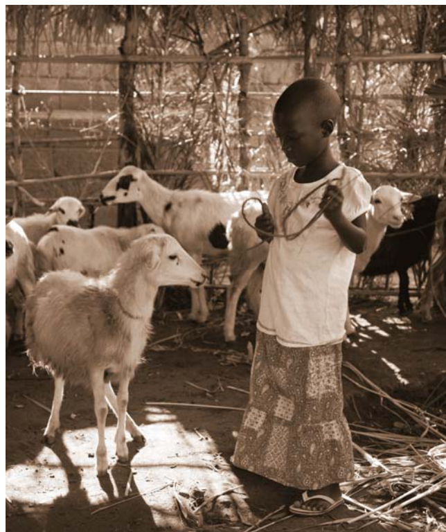
Child looking after goats. c. Steve Theobald, October 2007.

For the very few young men and women who were able to attend 'bush schools' during the wars to complete primary education, few opportunities exist for continuing formal education. The many years of war have almost totally eradicated secondary education in Southern Sudan, together with vocational and technical education (Inter-Agency Network for Education in Emergencies, 2009).