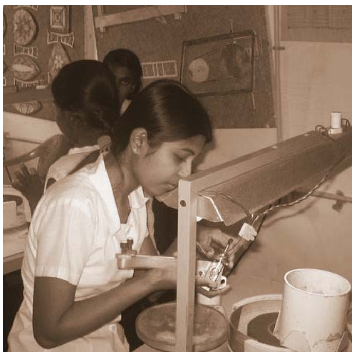
Young woman practices gem cutting in post-tsunami Sri Lanka. This is one of the successful adaptations of the BEST model that Plan hopes to replicate in South Sudan

BEST takes its role as a path-breaker seriously and ensures that its students get a taste of what the middle and upper class students regularly receive in their colleges through industry visits, guest lectures, campus placements and mentoring by corporate managers. This helps the students see what is on the other side. Mentorship is a key element of the model and is important at all levels. While mentorship programs are an obvious component of the facilitators' roles, mentoring by the alumni is also encouraged. Individuals working in government and corporate managers and executives in the private sector act as important mentors to newcomers and graduates in this program.