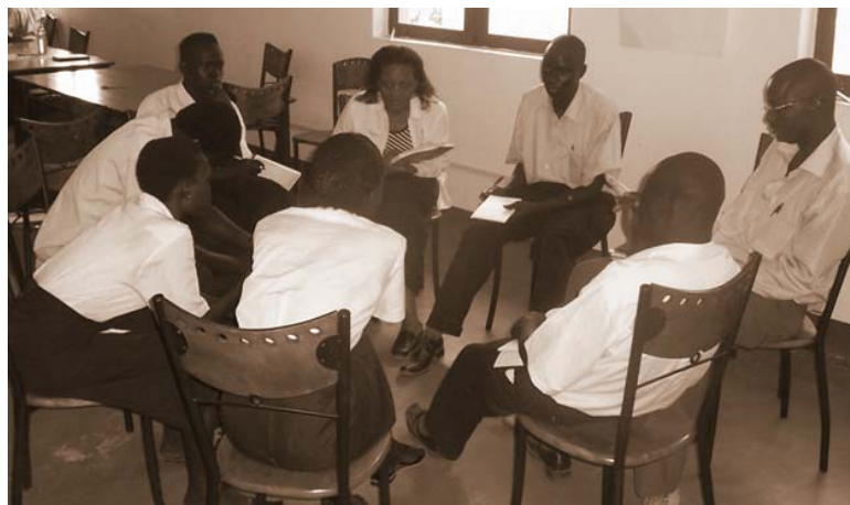
Consulting with Juba Technical High School students. Their views were an important factor in Plan's decision to focus on TVET.