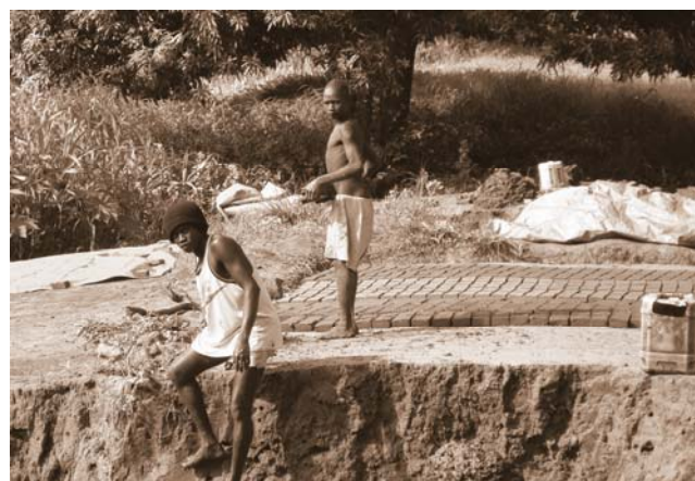
Brick workers, Juba.

The second type of TVET training program should be focused on people with no formal education, including ex-combatants, refugees, widows and other adults who have the responsibility for feeding their families. The government needs to train these community members in vocational skills relevant to local development needs. Short-term, non-formal, TVET training programs for millions of unskilled and unemployed people, especially in the villages, should be developed. Skills associated with traditional livelihoods practiced by rural and traditional communities can be associated with this