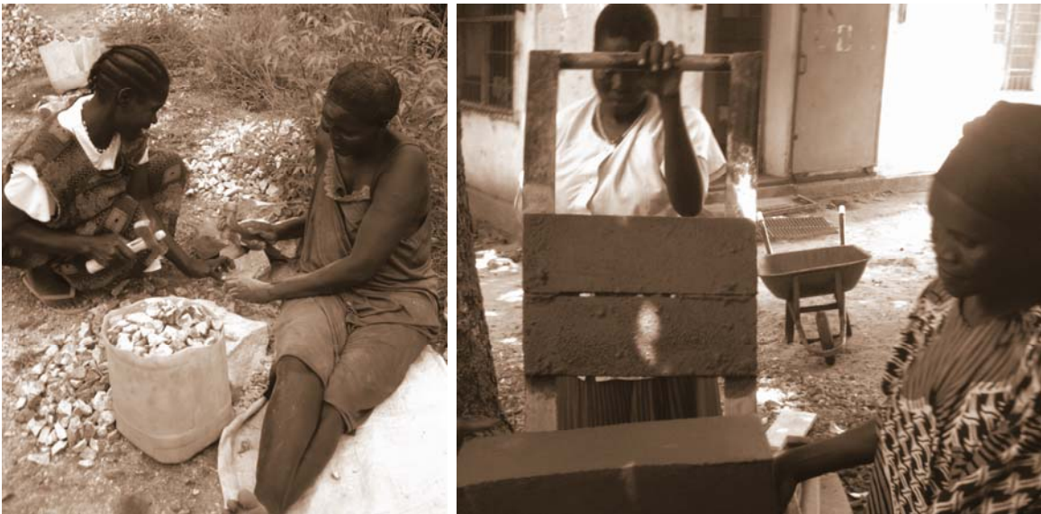
Women crushing rocks near Juba (left), and using appropriate technology for brick-making (right).