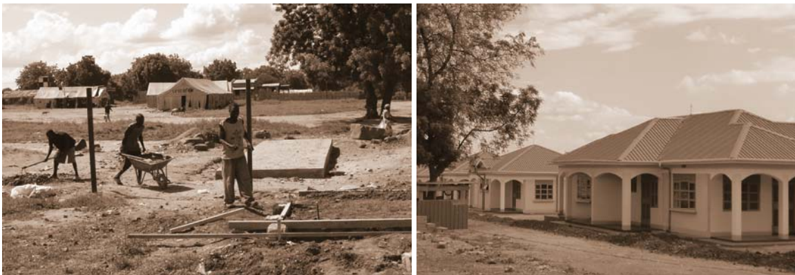
Juba Technical, then and now. Plan hopes that this will be the standard for reconstruction of TVET facilities in South Sudan. Left, building the perimeter fence. Right, the new teachers houses.

The operations of JTS were disturbed by the intensification of war during the SPLA/M period. During this time, Torit and Lainya were transferred to Juba and JTS worked in combination with these technical schools. In 1987, GOS renamed the school Juba Technical Senior Secondary School and, in 1992, it was renamed Juba Technical High Secondary School. Post-CPA, the school once again became JTS. It is now functioning after being renovated and retooled by Plan International.