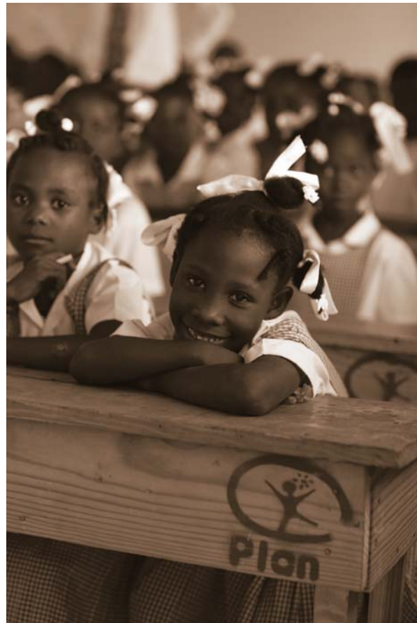
Girls learning in Haiti; Plan's experience working in post conflict countries is one of the key contributions to work in South Sudan March 2007.

During the past 23 years, Plan has implemented programs in Northern Sudan including Eastern Sudan and Darfur. In 2005, Plan set out to expand its activities in Darfur and Southern Sudan by initiating semi-independent programs. The Plan Southern Sudan program was officially registered in 2005. The first year of this Program was devoted to feasibility data collection and planning.