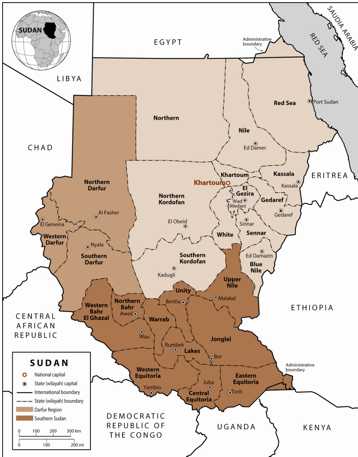
Figure 1: Map of Sudan

Adapted from UN Sudan Information Gateway, Map No. 3707 Rev. 10 April 2007.