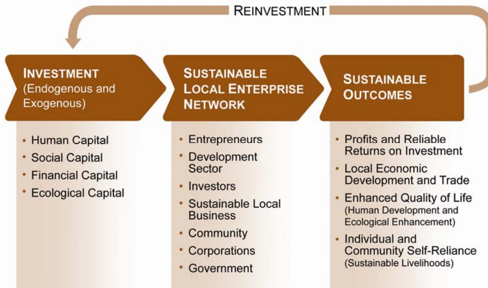
Figure 2: SLEN Development Model

Source: SLEN model from Wheeler et al. 2005