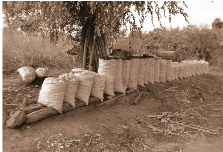
Charcoal business on the road to Lainya. The BEST model will train young people to sustainably realize local enterprise opportunities. c. Ndūng'ū Kahīhu, December 2009.

A SLEN approach (Wheeler et al., 2006) to TVET takes an inclusive and partnerships approach to address the needs of marginalized and vulnerable communities beyond the traditional short-term timeframe of most reintegration and development programs. Agriculture-related skills and training might take community food security and production as a goal. Considerations would be given for traditional approaches to agriculture and livestock including small and communal plots, the importance of cattle to social status and culture, transportation, market access, storage, availability of repairable