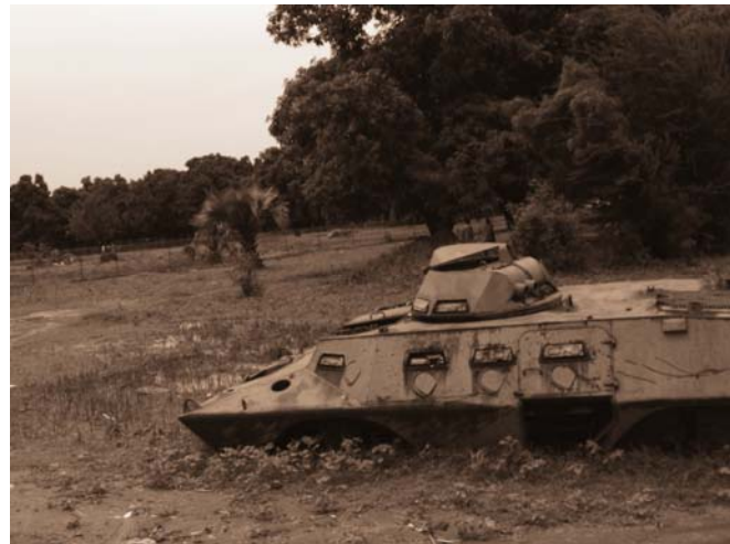
Remnants of the long-running civil war, Juba.

For two decades, the SPLA/M led this second war against the northern-based government. In January 2005, a peace accord called the Comprehensive Peace Agreement (CPA) was signed between the government of Khartoum and the SPLM/A. In the CPA, a “one country, two system” model was adopted, whereby the North and South will share power. In 2011, Southern Sudan will determine whether it wants to secede via a referendum.