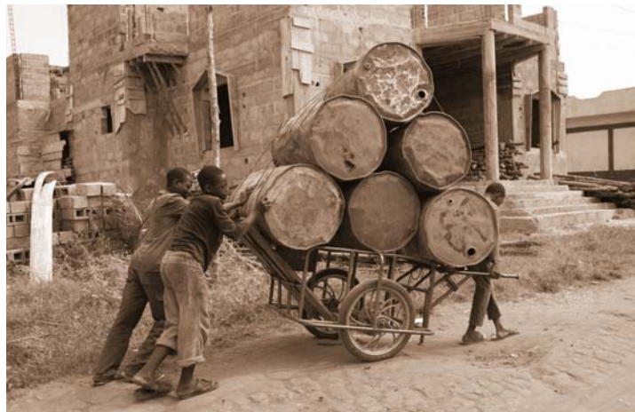
Young entrepreneurs in Benin. Plan's experience with youth livelihood projects elsewhere in Africa is part of the organization's value-add to Southern Sudan. c. Steven Theobald, October 2007.

Harnessing entrepreneurial capacity may create opportunities for some demobilized combatants in Southern Sudan. For example, in May 2006, a high concentration of combatants were awaiting the beginning of demobilization activities in the town of Rumbek and its surrounding area. Of these, many combatant youth were utilizing their skills and resources – including vehicles and contacts – to engage in a number of enterprising activities. These youth expressed a strong desire for entrepreneurial options post-demobilization (Abdelnour et al., 2008b).