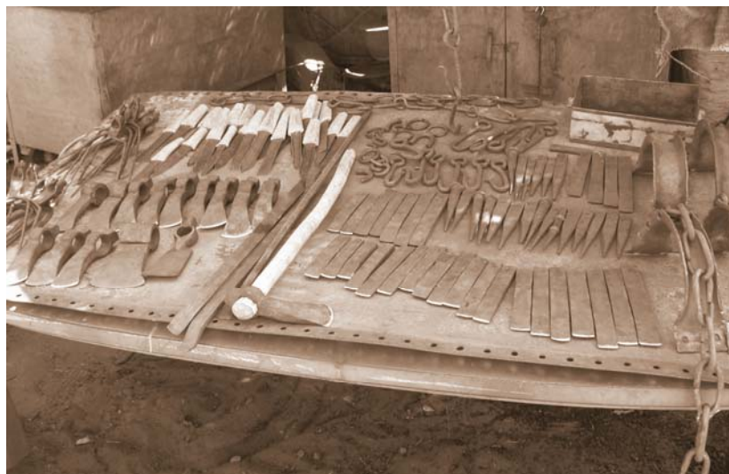
Above: Blacksmiths at work, El Fasher. Below: Examples of blacksmith's work. c. Samer Abdelnour, December 2009.