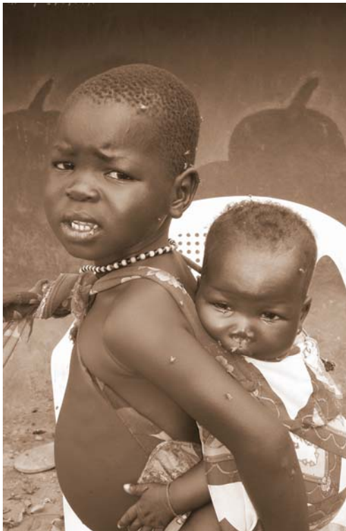
Children looking after children, Torit. c. Dr. Dominic Odwa Atari, March 2009.

Due to the many years of war, the lack of facilities and capacity and the continued tribal structures of many communities in Southern Sudan, many young men and women have missed the opportunity for education. Children in many regions in Southern Sudan are still more economically valuable when they are at home rather than at school. When at home, girls fetch water, cook, clean and take care of little children and babies and boys often look after cattle (Brophy, 2003). Many of these young girls and boys have learnt how to shoot firearms but not how to read and write. When they grow-up, they will have no essential skills and capacities to live in modern society where literacy is a key component of survival.